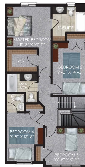
Exterior Second Floor | Opt 2