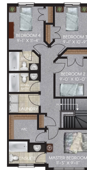
Exterior Second Floor | Opt 3