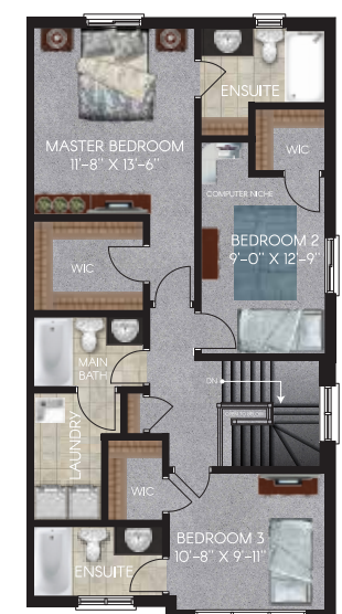
Exterior Second Floor | Opt 4